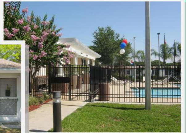
Palm Lake Village now