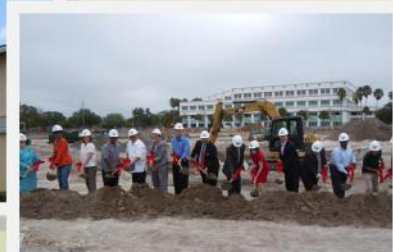
Groundbreaking, Pinellas Heights, 2012