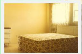
Palm Lake Village, 1968

Palm Lake Village was built in 1968 at a cost of $2.8 million . Originally a 474 unit mobile home park, it was home to 600 elderly residents, 62 years or older. The maximum annual income for a couple was $4,350, and $3,750 for individuals.