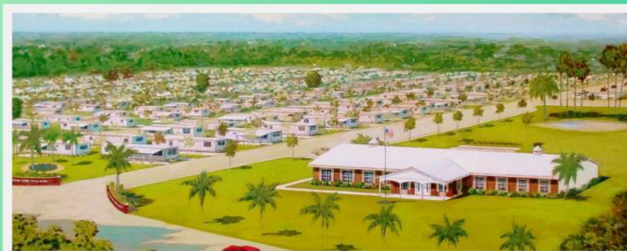
Painting of Palm Lake Village by Gene Comer

In 1989, the mobile homes were replaced with 475 permanent homes.