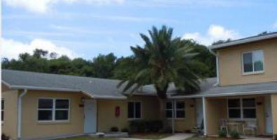
Norton Apartments, 2012

Over the next twenty years, PCHA would either build or acquire more than 1300 additional housing units, including building Ridgeview at what is now Rainbow Village, Lakeside Terrace and Crystal Lakes Manor, French Villas at what is now Landings at Cross Bayou, and Palm Lake Village.