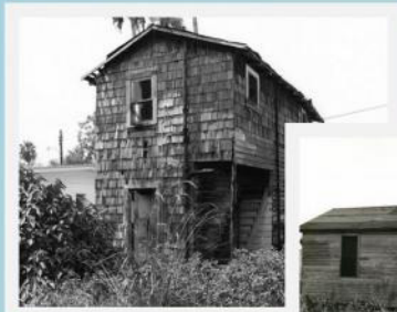
Substandard housing, 1960's