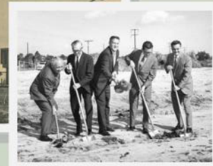
Groundbreaking for Heatherwood, 1967

In the early 1960's, the incredible need for high-quality, low-cost housing in Pinellas County finally lead to the formation of the Pinellas County Housing Authority in 1965 . The first project PCHA completed was the futuristic looking Heatherwood Apartments in Pinellas Park which provided homes for the elderly in 1968.